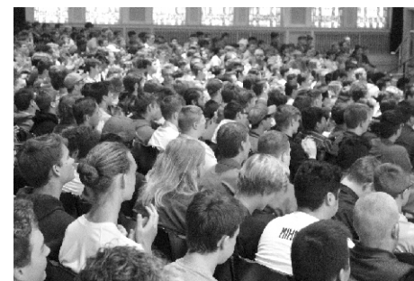
800 High School boys

There were 1,025 young men who came to the University of Wisconsin - Milwaukee Zelazo Center to sing for most of day representing 43 area High Schools and 19 area Middle Schools. The annual event, under the direction of Dr.