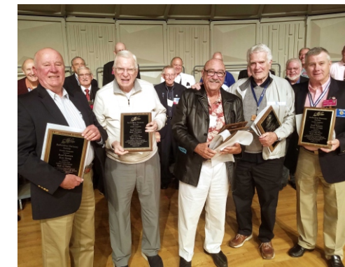
Road Runners Quartet - 1972 LO'L District Champion