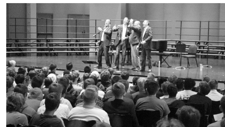
The Border Project sang for the High School boys

The featured guest quartet was The Border Project , the 2017 District Champions of the Land O' Lakes. Singing three songs to 800 High School boys, it was obvious that these students loved to hear chords being rung.