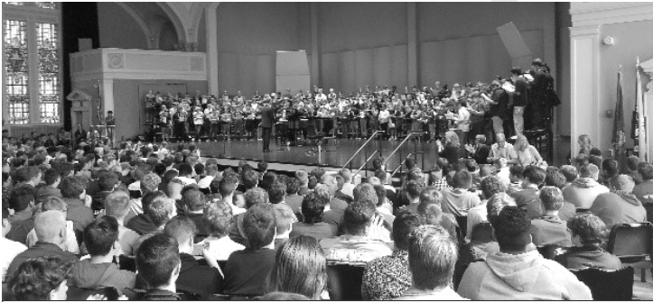
Real Men Sing: Junior High Chorus