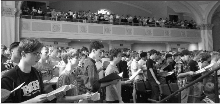
Real Men Sing: High School Chorus

Have you used the 4-minute video to introduce barbershop singing to your music educators yet? It's available on YouTube at: https://www.youtube.com/watch?v=hkyJwOBFO_0 . Or, contact me and I'll send you the video downloaded onto a flash-drive. This quick hitting resource, produced by the Barbershop Harmony Society at our insistence, captures the enthusiasm of groups that performed at the 2019 Midwinter. It's useful as you visit schools to generate interest among music educators and students to try out singing barbershop!