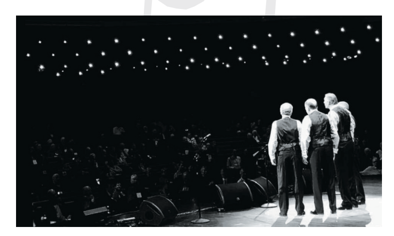
The Way We Were. And Will Be Again.