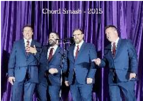
Chord Smash - 2015