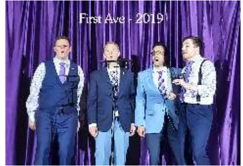
First Ave - 2019