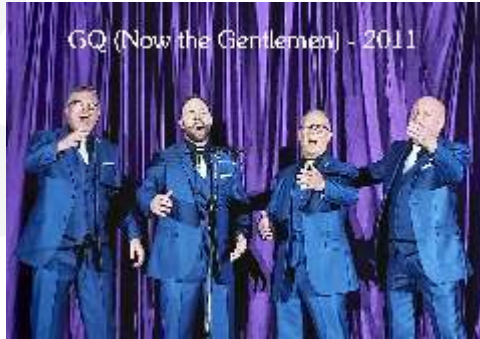
GQ (Now the Gentlemen) - 2011