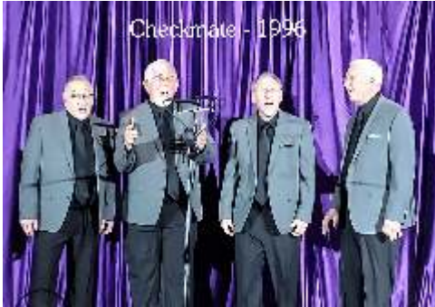
Checkmate - 1996