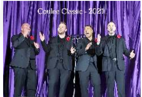
Coullee Classic - 2021