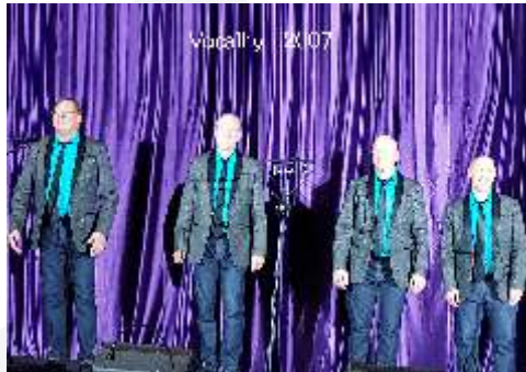
Vivaldi - 2007