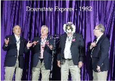
Downstate Express - 1982