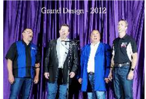
Grand Design - 2012