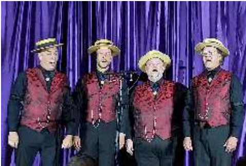
Main Street 2017 Int'l Quartet Champion Mic Testers & Showcase Headliners