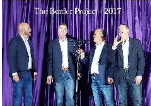
The Border Project - 2017