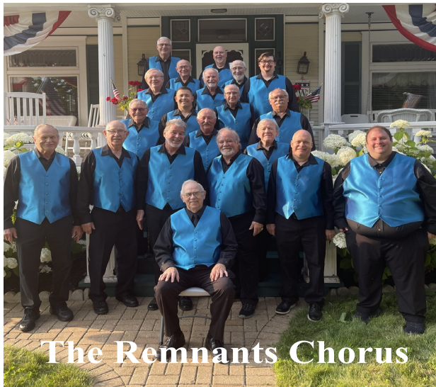
The Remnants Chorus