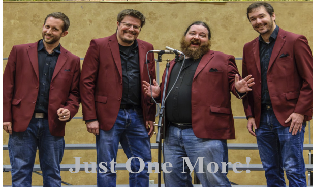
Just One More!