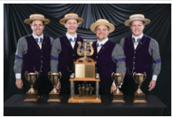
Main Street 2017 International Champs