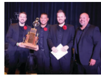
Coulee Classic 2021 District Champs

For Tickets Contact: The Indianhead Chorus (715) 483-9202