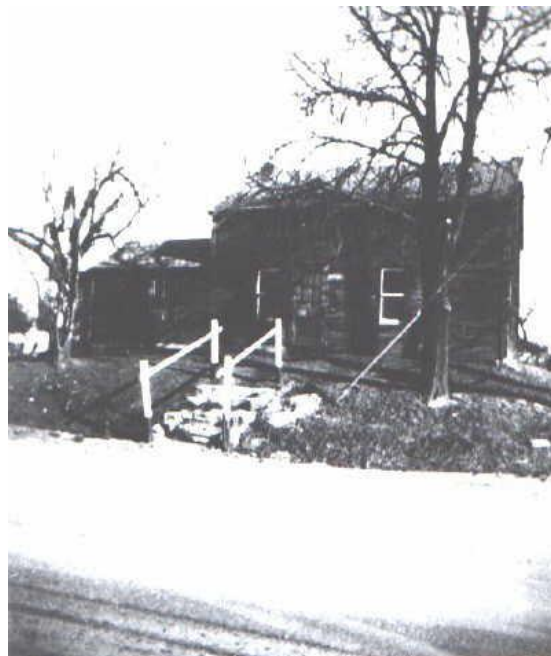
Home on Rymal Road at the northwest corner of Ryckman’s Corners