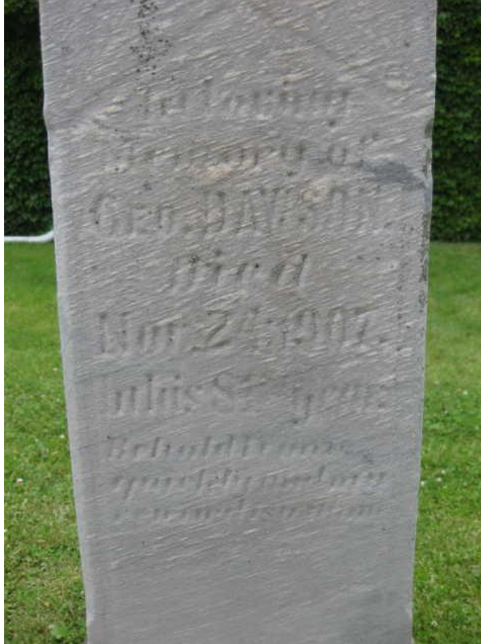
Close up of inscription on Dawson tombstone