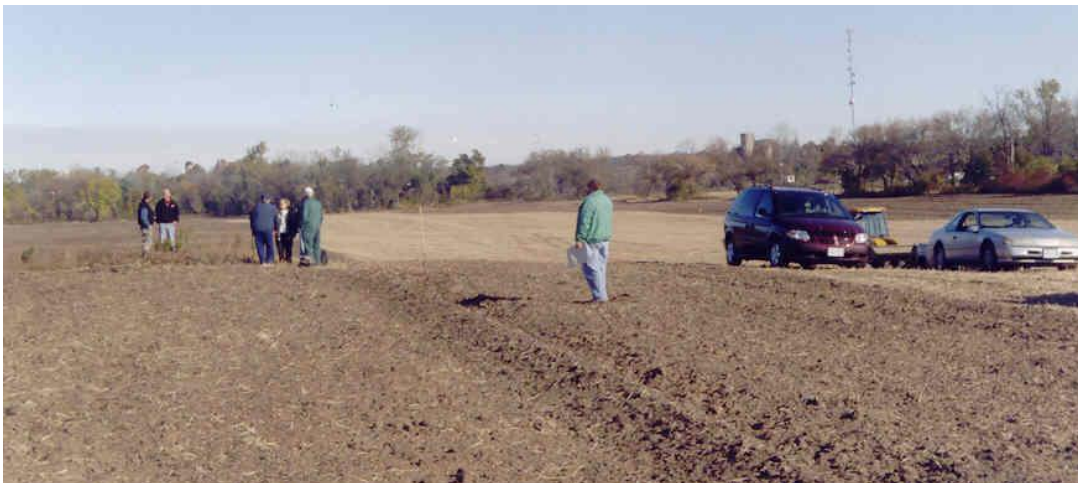
Knoll on "Young's Island" looking north to the head of the knoll. The grassy area by the cluster of people was the only part not plowed (a postage stamp compared to the true size of the Cemetery. The grave shaft of the person whose remains were uncovered is under where the third person on the left in the cluster of 3 is standing.

17 October 2003 The appointed day of the search dawned bright and sunny, and the representatives of the family, the County Government, and the Provincial Government headed across the field to the knoll. Messrs. Shipway and Tom's map were right on the button as it turns out. One of the more ghoulish aspects to this whole business is that for the Cemetery to be declared "a cemetery" under the Provincial Ontario Cemeteries Act, human skeletal remains must be located. The backhoe scraped the topsoil and burial shafts were observed. One was chosen for this delicate phase of the process. Down about 3.5 feet, Neal Ferris, the Provincial Archaeologist, located part of an intact skeleton, which was then quickly and carefully covered over, and Mr. Ferris declared the site a cemetery by virtue of Provincial law. There was a moment of silence for the ancestor who, out of necessity, had to be disturbed in order that all interred there could finally rest in peace. It had been 28 years since I began the project which had consumed so much of my time and energy. My absence on the day, due to my teaching schedule in California, is something I will always regret.