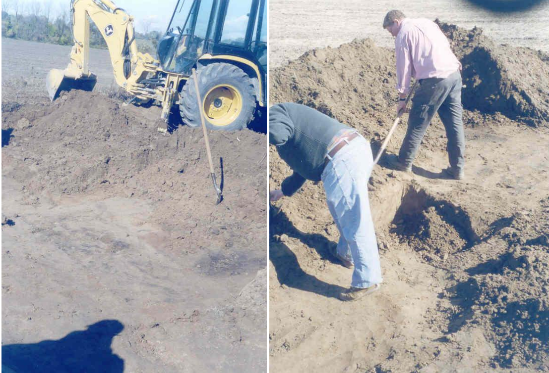
Left: This picture faces to the north west and shows the 6' x 2' mottled soil that is the graveshaft of the ancestor whose remains were disturbed in the service of ensuring that none will be disturbed for ever more.