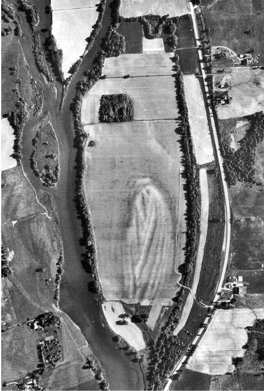
Aerial view of the YTBG cemetery and surrounding terrain in 1978. North is to the top, present - day Highway 54 snakes around on the right side of the photo, the Grand River is on the left, with the cemetery knoll prominently displayed in the central area shown as an elliptical striated feature. The row of trees to the right of the knoll marks the old feeder canal. The YTBG is at the north (upper) end of the knoll.