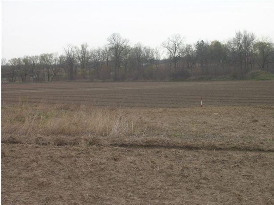
Single survey corner post amidst ploughed field