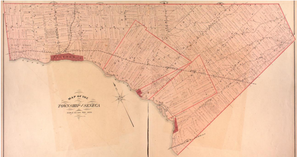
Nelles Tract to left (west) and Young Tract to the right (east) shown on the 1879 Atlas of Haldimand County, Seneca Township