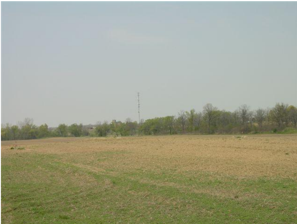
Barely visible corner posts of survey markers and evidence of ploughing of Cemetery.