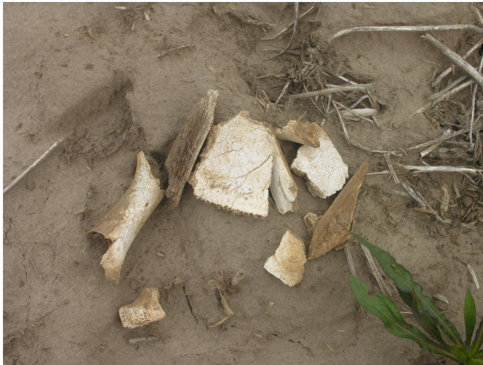
Bone material left near survey corner post in Cemetery that had been ploughed.