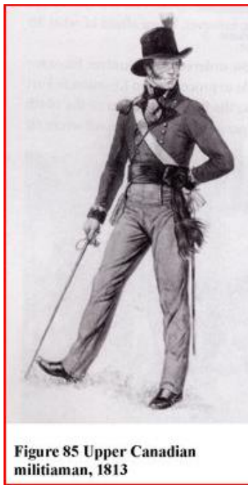
Figure 85 Upper Canadian militiaman, 1813

Captain of a Battalion Company of the 5 th Lincoln Militia throughout the War.