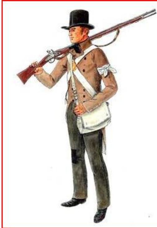
Uniform of Private in 5 th Lincoln Militia (Hemmings, 2012)