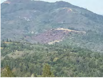
View of burned area from Mt. Veeder Rd.