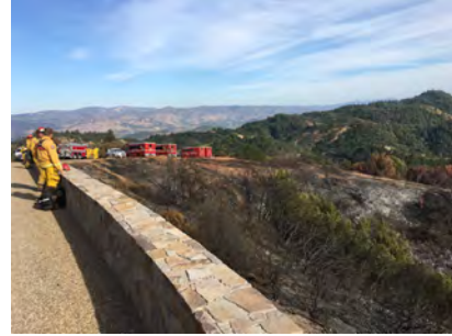
View of burned area from Clear Creek Rd. and saved house!

Thanks to the hard work of your local volunteer firefighters and the paid staff, we did not lose a single structure!