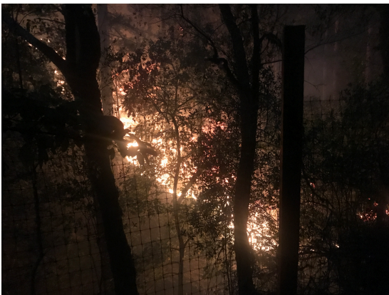
And behind a neighbor's house on lower Dry Creek Rd.