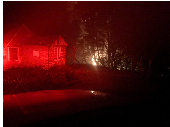
Nuns Fire comes to the Piner's property and across the street from Chief Green's house.