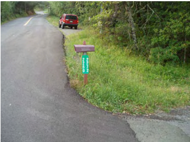
Good Address! Easy to find.

Go to www.mtveederfiresafe.org to find the order form near the bottom of the website and how to pay. Help the local Dry Creek-Lokoya Volunteer Fire Department firefighters and other emergency apparatus easily find your home when every second counts!