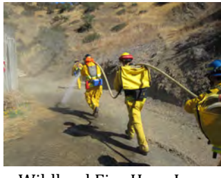
Wildland Fire Hose Lay