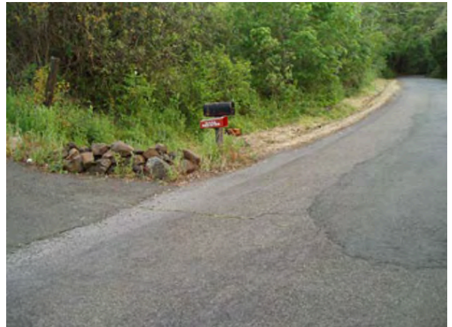
What is the address?