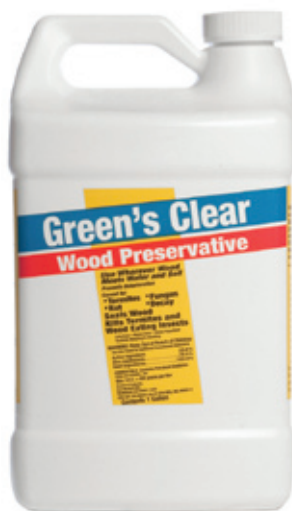
For Interior or Exterior Use.

When color is not an issue, copper products are the best and the most effective solution. When applying the preservative around plants, it's best to cover the plants for complete protection. However, when the preservatives dry, they are perfectly safe to use on planter boxes and greenhouses.