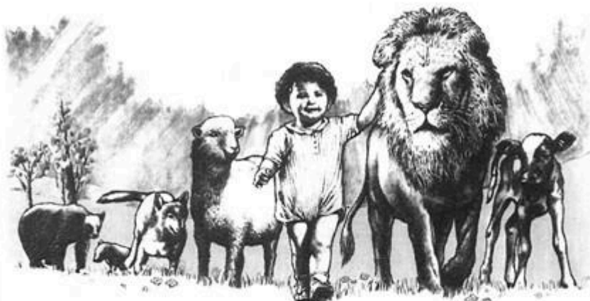
Will these conditions really prevail on earth?

on earth. Already today within the organization of Jehovah's Witnesses earth wide a condition of spiritual prosperity, peace and security exists, as depicted in such a beautiful way by God's prophet Isaiah. However, will such paradise conditions in due course be extended so as to be fulfilled in a literal way?