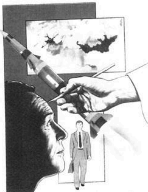
In this nuclear age a figurative man in linen is carrying on a fearless work. Are you involved in that work?

6. How many of that "royal priesthood" are yet in the flesh on earth, and as what figurative person do they serve?