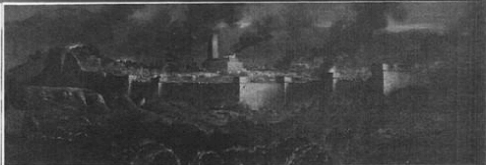
The fate of ancient Jerusalem shows what will soon happen to Babylon the Great

[Jehovah's] temple."—Revelation 7:1-3, 9-15.