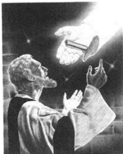
As John received a symbolic scroll and a command to "prophesy again," so Christians today fearlessly declare God's message

13 What experience like that described in Revelation chapter 10 did the anointed remnant have after World War I, and after the refreshment was taken, what command was given?