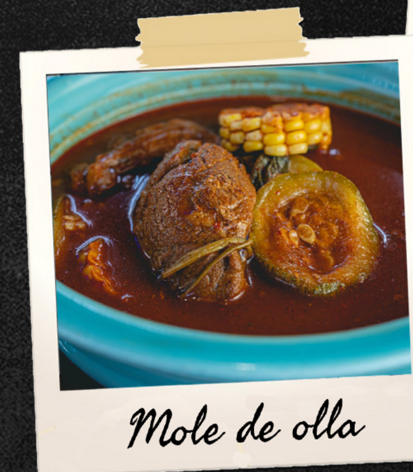
Mole de olla