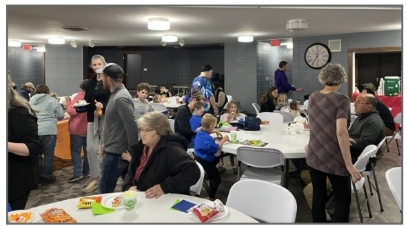
Graduates and their families enjoyed refreshments following the graduation ceremony.