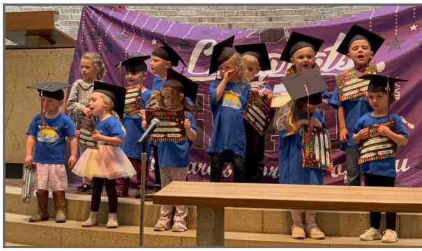
Each youngster received a Trinity Preschool Diploma

Trinity's All Day Pre-K program prepares each youngster for success in Kindergarten by learning social and emotional skills, along with alphabet and word recognition, numbers, writing and reading skills.