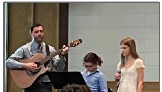
Special music for Easter