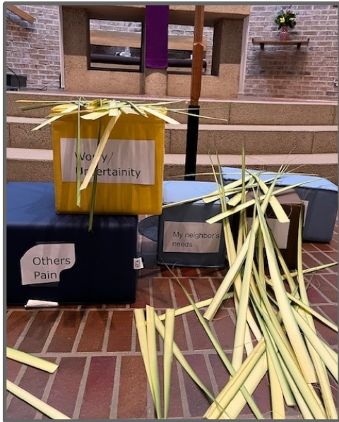
Laying our troubles at the cross on Palm Sunday