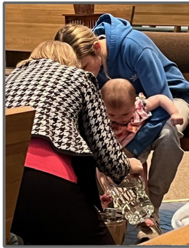
Even our youngest members participated in the foot washing