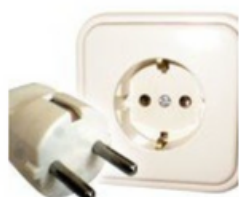
Type F: This socket also works with plug C and E

EGYPT: uses standard European type F (like Europe) or sometimes C. Standard voltage is 220 V and the standard frequency is 50 Hz plug outlets. For reference, standard voltage in Canada is 100 - 127 V. You will fry your electric devices without a voltage converter!