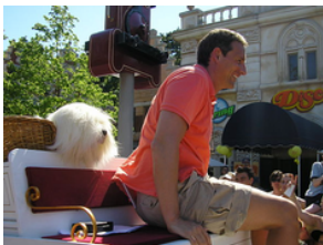
Samson and Gert

PLOPSALAND: is a theme park located in Adinkerke, Belgium - part of the municipality of De Panne, and is owned and operated by Plopsa ( the theme park division of Studio 100, the company operates 8 water parks across Belgium, The Netherlands, Germany, and Poland ). Plopsaland was formerly known as Meli park from 1935-1999. During the renovation in 1999, several characters from Studio 100 were used - such as Samson en Gert and Kabouter Plop - to theme new and old attractions. The competition will be held within Plopsaland!