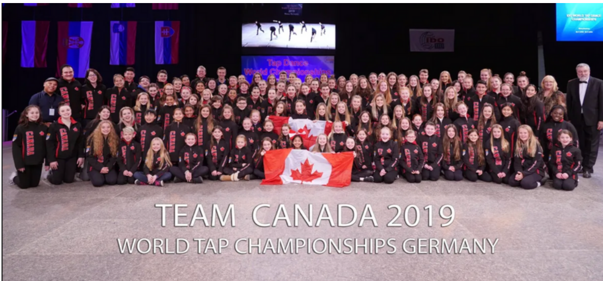
TEAM CANADA 2019 WORLD TAP CHAMPIONSHIPS GERMANY