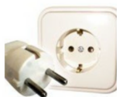
Type F: This socket also works with plug C and E

GERMANY: uses standard European type F. Standard voltage is 230 V and the standard frequency is 50 Hz. For reference, standard voltage in Canada is 100 - 127 V. YOU NEED A CONVERTER, NO JUST ATTACHMENT - You will fry your electric devices without a voltage converter!