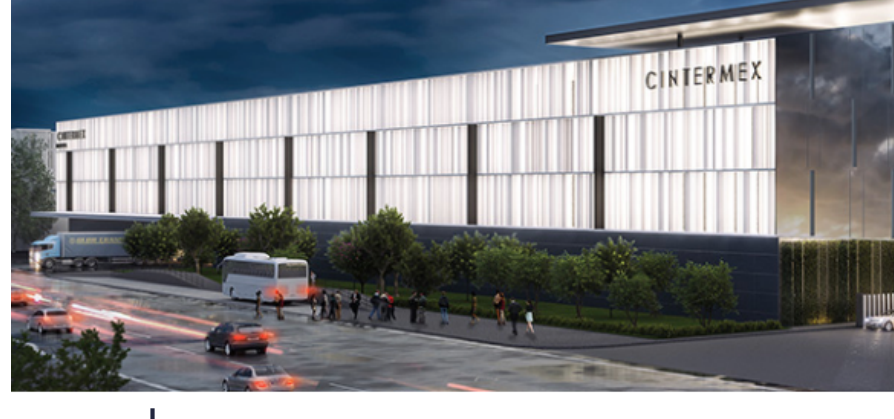
VENUE Cintermex Convention Centre, Monterrey, Mexico