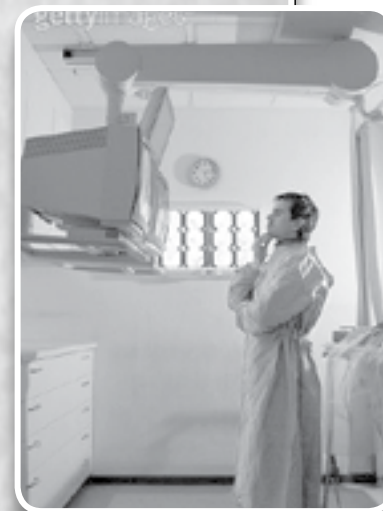
Saint Anthony's Health Center MD. Name Here

Healing the body... and healing the soul. This is the mission of Saint Anthony's Health Center.