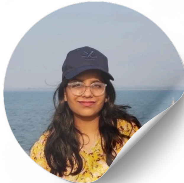
Pragya Deutsche Bank / 20 LPA