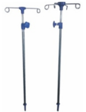
IV ROD CODE - AP34