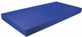
PLAIN MATTRESS CODE - AP35