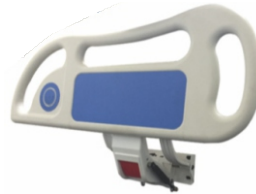
ABS SIDE RAILING CODE - AP33