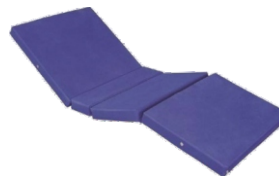
FOWLER MATTRESS CODE - AP37