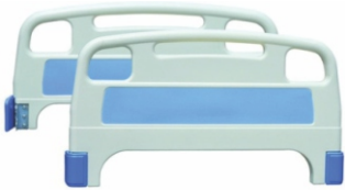
ABS PANEL CODE - AP31