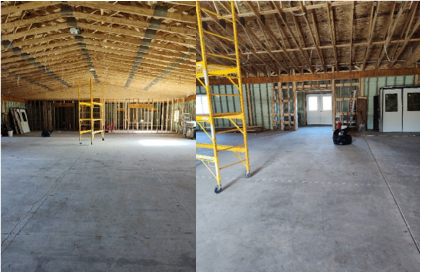
New Learning Center