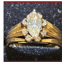
Jewelry Single Chris Cross