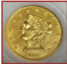
Coin Single Bill Green