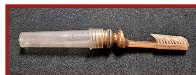
Odds & Ends Single Cliff Cassidy