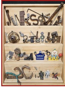
Odds & Ends Group Cliff Cassidy