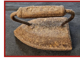
Artifact Single Bill Green