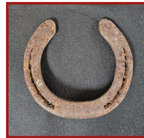
Odds & Ends Single Danny Case