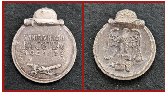
Artifact Single Bill Green