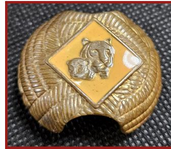
Odds & Ends Single Danny Case