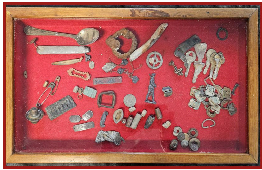
Display of the Month Gary Flatt