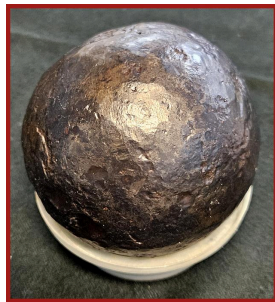
Artifact Single Dave Gascon