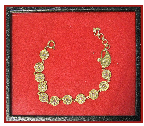
Jewelry Single Jim Tippet