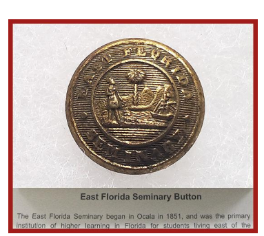
Artifact Single Rob Loucks