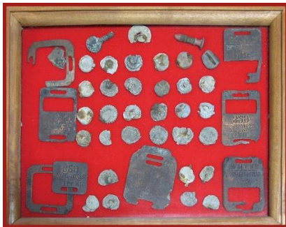
Artifact Group 1 st Jim Tippitt