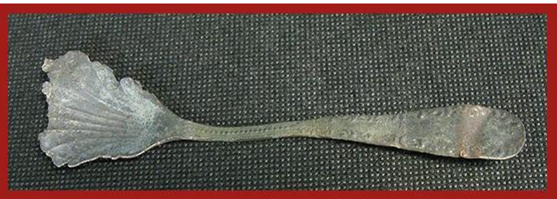
Artifact Single 1 st Marc Hoover