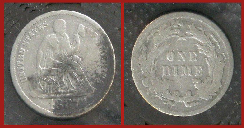
Coin Single 1 st Jim Tippitt