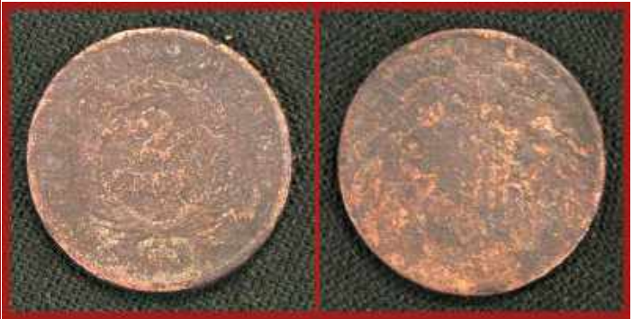
Coin Single 1 st Gage Dover