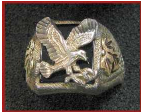
Jewelry Single 1 st Bill Green