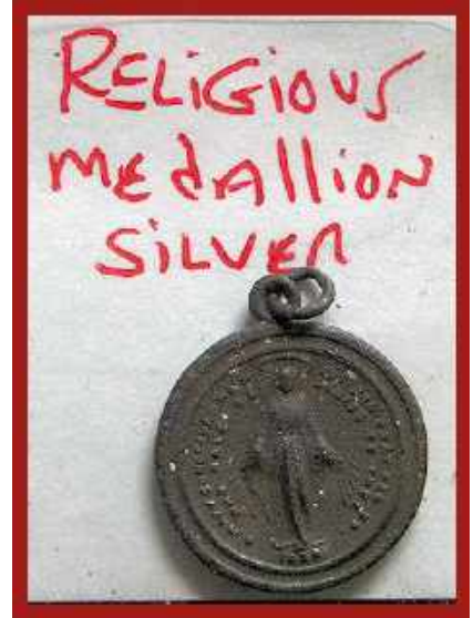
Artifact Single 1 st Rob Hill