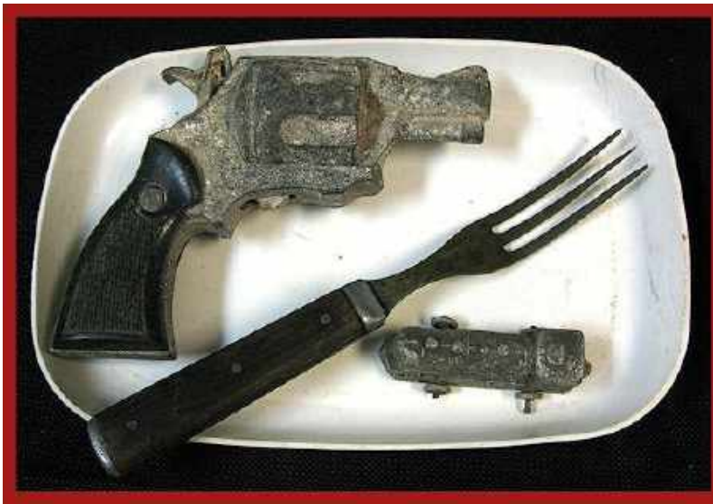
Artifact Group 1 st Gage Dover