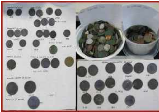
Coin Group 1 st Lee Neubauer