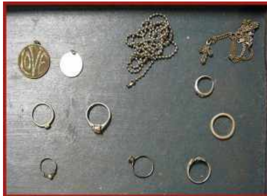
Jewelry Group 1 st Gage Dover