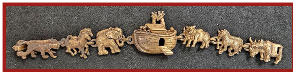
Single Odds & Ends