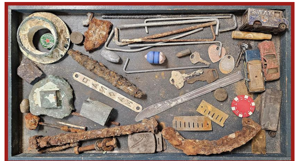
Group Odds & Ends