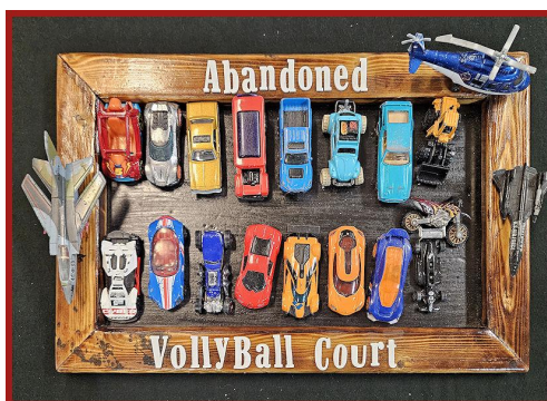
Best Display of the Month