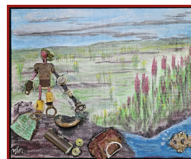
Display of the Month Name Needed