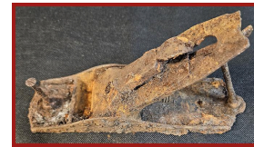
Odds & Ends Single Danny Case