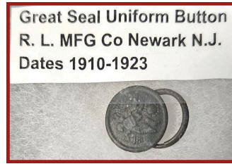
Artifact Single Leilani Rodriguez