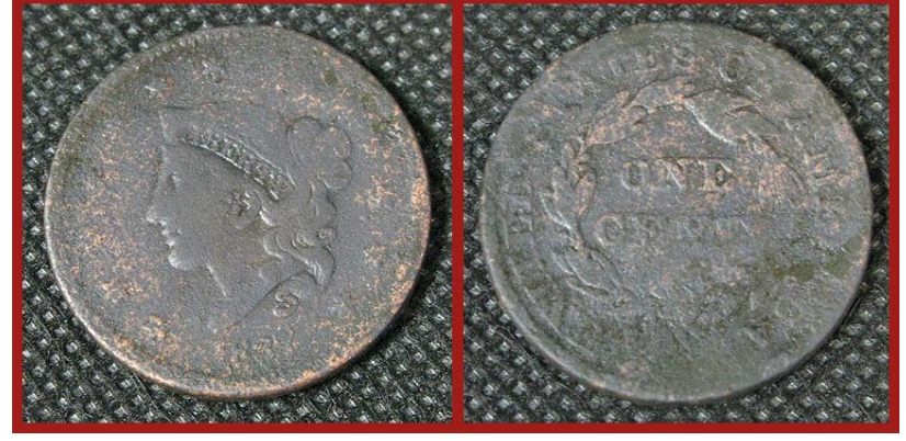
Coin Group 1 <sup>st</sup> Pete Ritcher