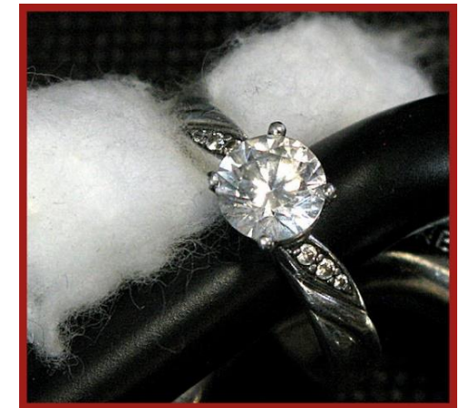
Jewelry Single 1 <sup>st</sup> Bill Green