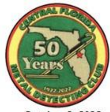
October 8, 2022 465 W. Highbanks Rd Debary, FL