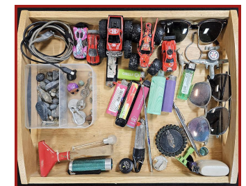
Odds & Ends Group Gary Flatt