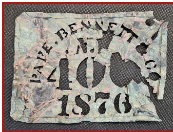
Artifact Single Gage Dover