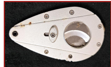
Odds & Ends Single Rob Hill