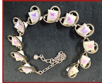
Jewelry Single Danny Case