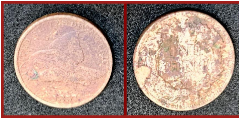
Coin Single Gage Dover