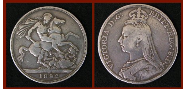
Group Coins - Bill Green