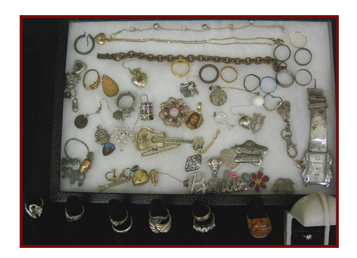
Single Artifact - Steve Meeks