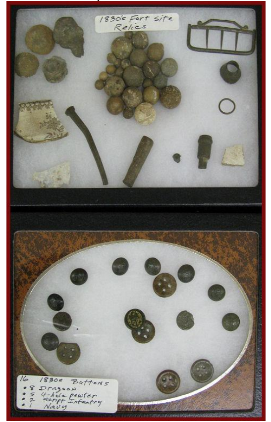
Single Odds/Ends - Steve Meeks