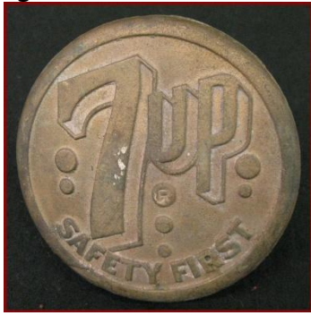
Group Odds/Ends - Bill Green