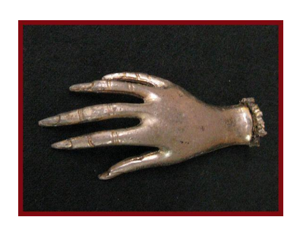
Group Odds & Ends