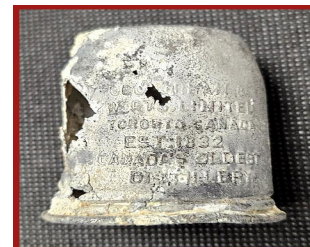
Odds & Ends Single Gary Flatt