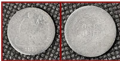
Coin Single Gary Flatt