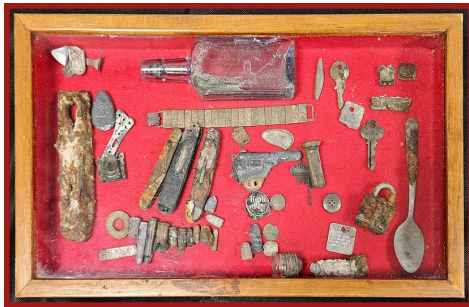
Display of the Month Gary Flatt