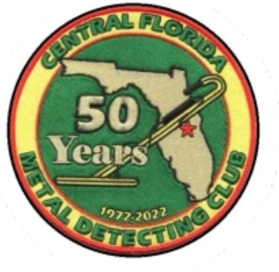
Artifact Single Gary Flatt