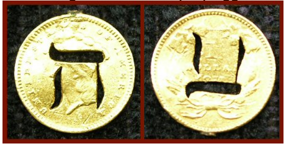
Group Coins - Bill Green