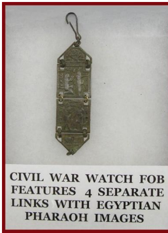
CIVIL WAR WATCH FOB FEATURES 4 SEPARATE LINKS WITH EGYPTIAN PHARAOH IMAGES