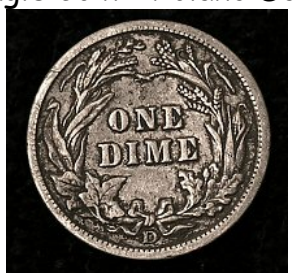
Group Coins - Bill Green