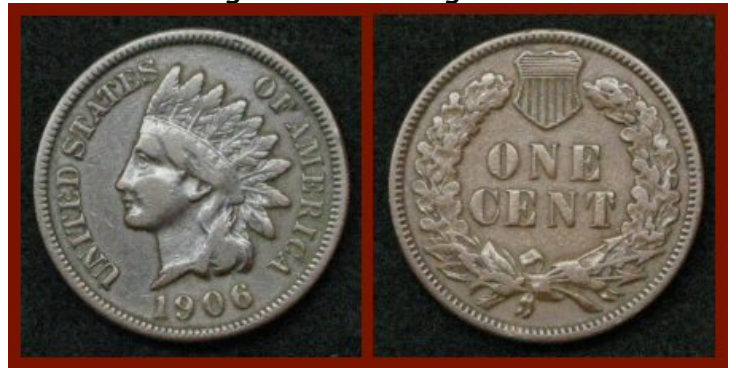
Group Coins - Chuck Hosbein