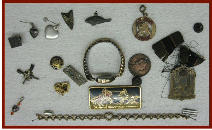
Single Artifact - Ralph Flippo