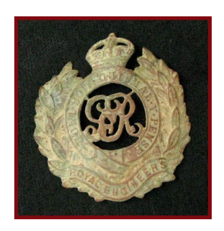
Group Odds & Ends