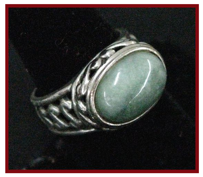
1<sup>st</sup> Place - Nanette Burdick: Silver Ring 2<sup>nd</sup> Place - Jim Hooks: 13 Gram 18kt & Platinum 3<sup>rd</sup> Place - Matt Fitzpatrick: 14kt Earring with Diamonds