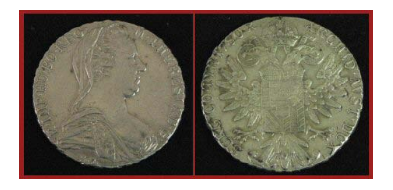
Group Coins - Bill Green