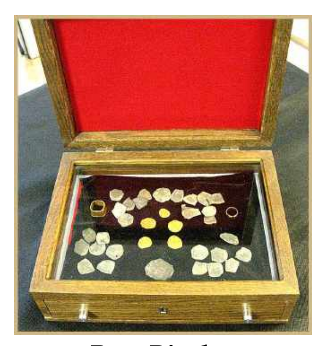
Best Display Jim Tippitt