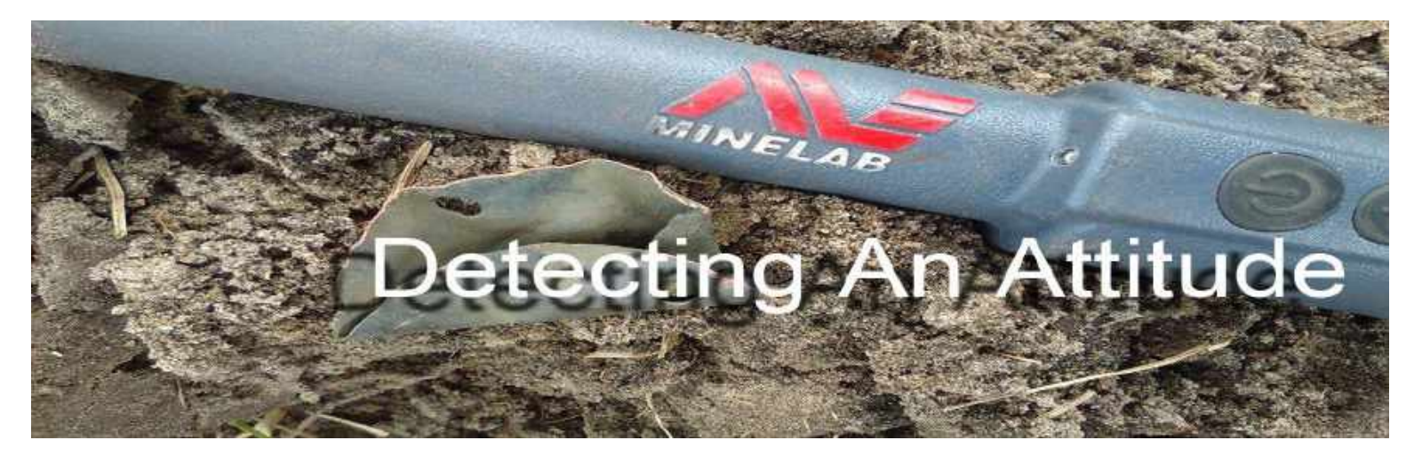
By Jim Fielding