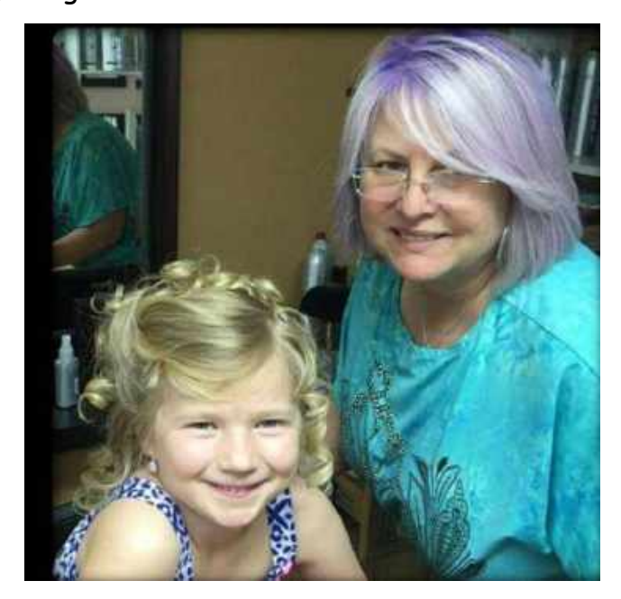
(Master Hair Stylist!)