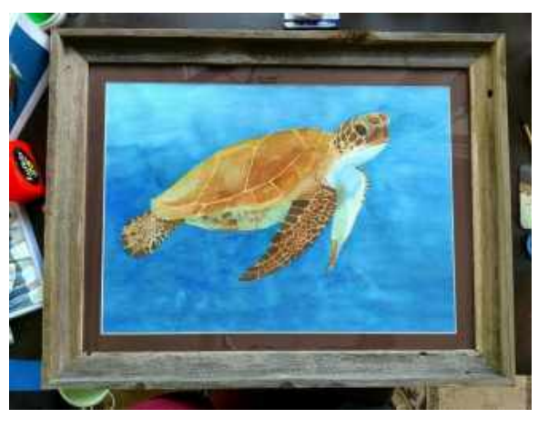
(Painting By Vickie)