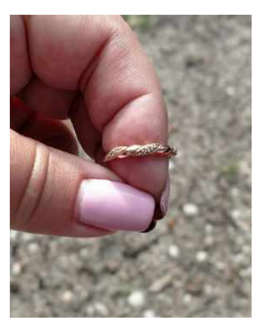
(First Ring Recovery)