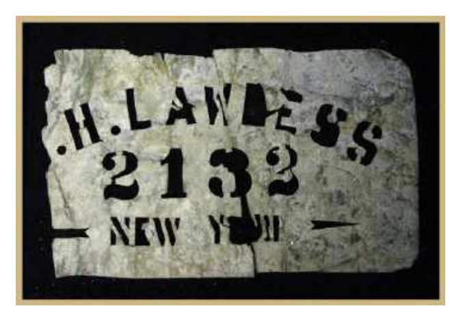
Artifact Single 1st Jim Tippitt