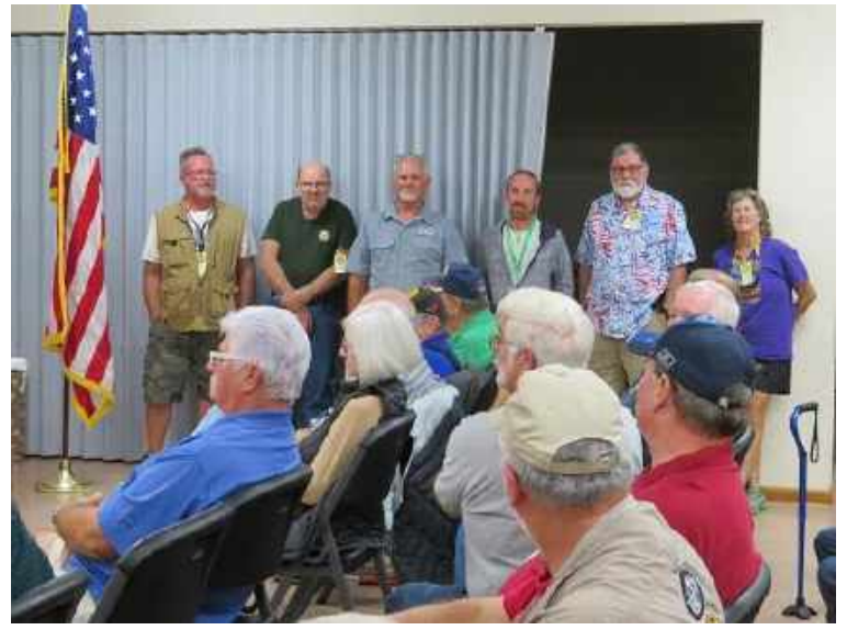
First Place Winners March 2022