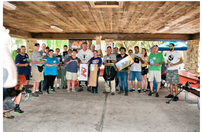
CONGRATS SHOOTOUT WINNERS!