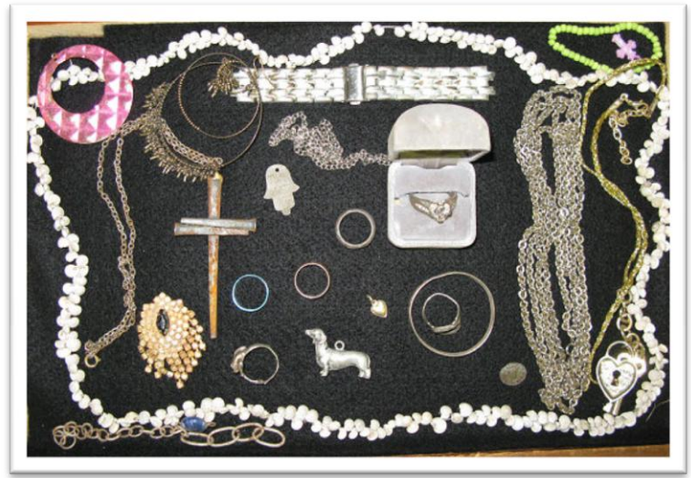
Single Artifact - Bill Green