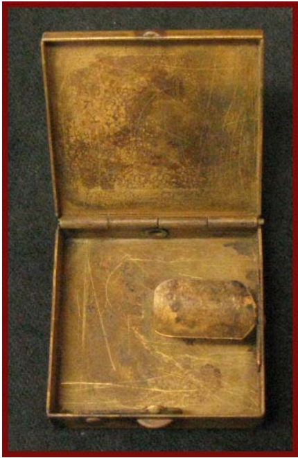
Group Odds/Ends - George Case